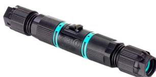
2 way terminal block 2 poles IP68 H2O stop. (Ø4+6,9mm cable) F990C050000