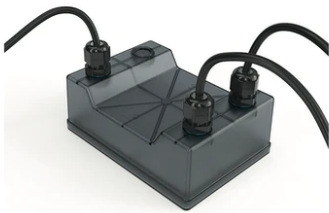
1-10V PWM control interface 24Vdc 120W. IP67. Power supply not included. F990B00A000