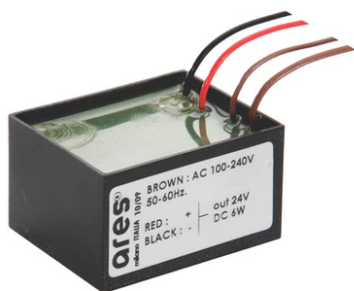
Power supply 24V 8W / 110-240V IP65 Class II selv. Non Dimmable RF25748