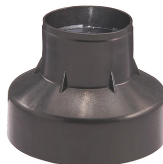
Box for installation F004Z0K0000