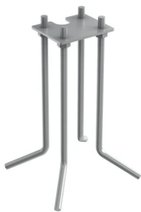
Minimal Klein Pro ground fixation plate, 47x57xH160 mm F002Z030000.A