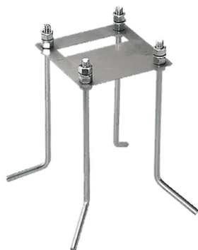
Klein Pro base plate and fixing bolts 85x85xH160 mm F002Z020000