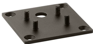
Fixing base for solid surfaces Deep Brown F002Z010018.A