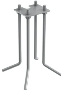
Minimal Klein Pro ground fixation plate, 47x57xH160 mm F002Z030000.A