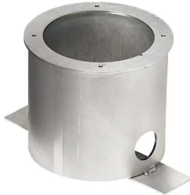
High Resistance In-ground Box Kamino 180 195