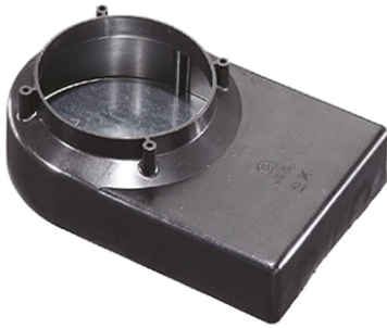
Box for Installation Kamino 180 194