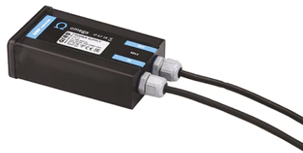
Power Supply 20W 220+240V/24Vdc Ip67 147