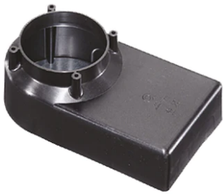
Box for Installation Kamino 130 192