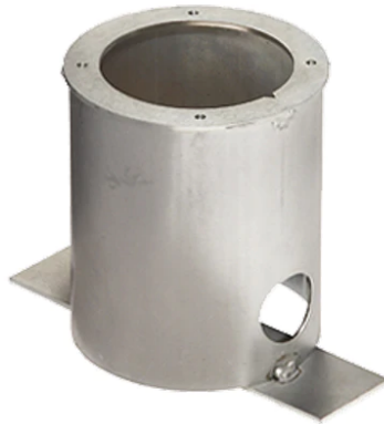
High Resistance In-ground Box Kamino 130 193