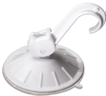
Suction Cup K12 153