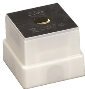
Box for Installation K12Sq 151