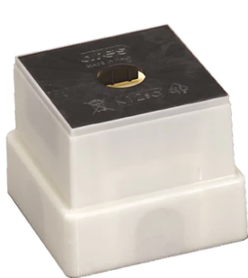
Box for Installation K12Sq 151