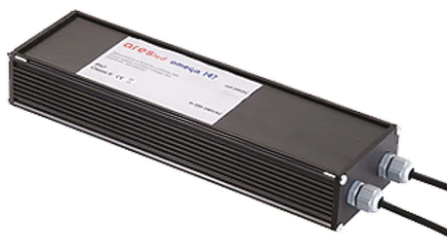
Power Supply 96W 120÷277V/24Vdc Ip67 156