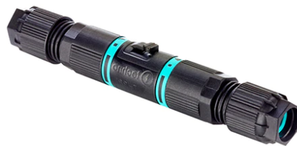
2 Way Terminal Block 2 Poles Ip68 H2O Stop 269