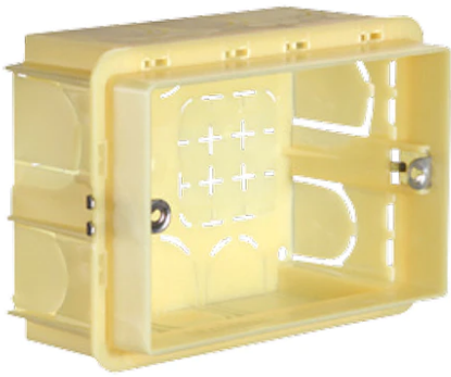
Box for Installation Alfa/Beta/Gamma/Trixie/Trixie Round 105