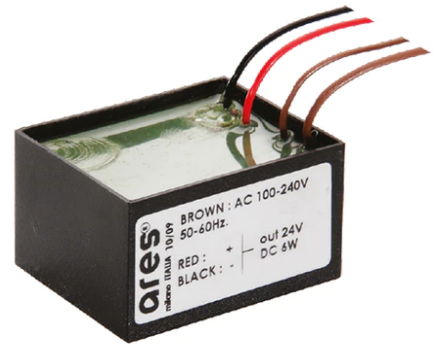
Power Supply 100÷240Vac/ 8W at 24Vdc/ 6W at 350mA Ip65 106