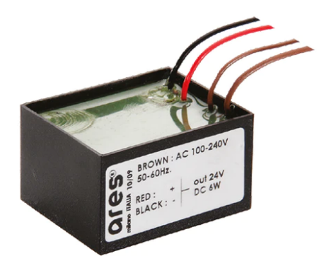
Power Supply 100÷240Vac/ 8W at 24Vdc/ 6W at 350mA lp65 106