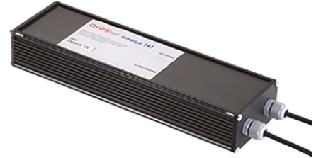
Power Supply 50W 120+240V/24Vdc Ip67 155