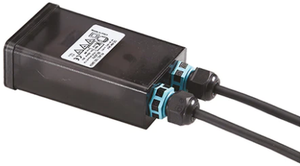
Power Supply 8W 110+240Vac/24Vdc Ip67 235