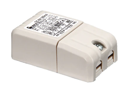
Power Supply 8W 100÷240Vac/24Vdc 350mA lp20 150