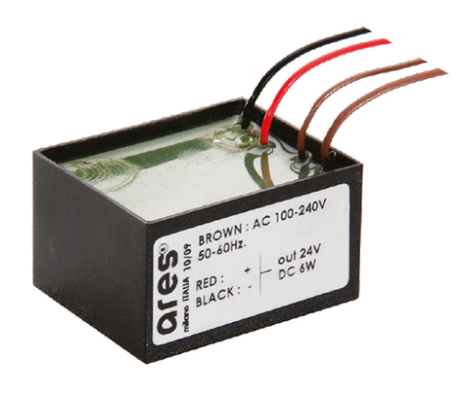
Power Supply 100÷240Vac/ 8W at 24Vdc/ 6W at 350mA lp65 106