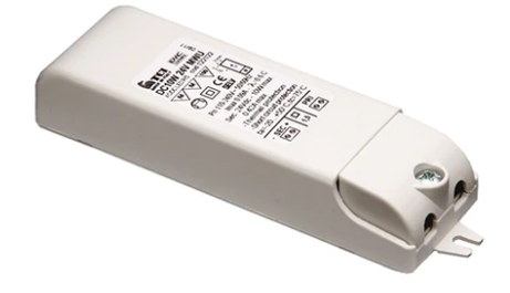
Power Supply 100÷240Vac/ 8W at 24Vdc/ 6W at 350mA Ip65 106