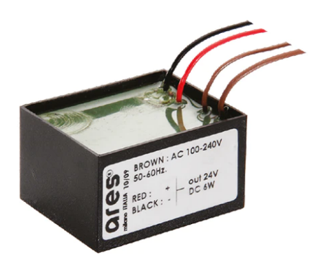
Power Supply 100÷240Vac/ 8W at 24Vdc/ 6W at 350mA lp65 106