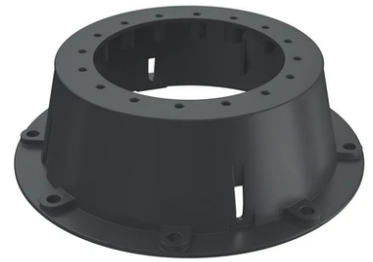
Box for ground installation F018Z000000