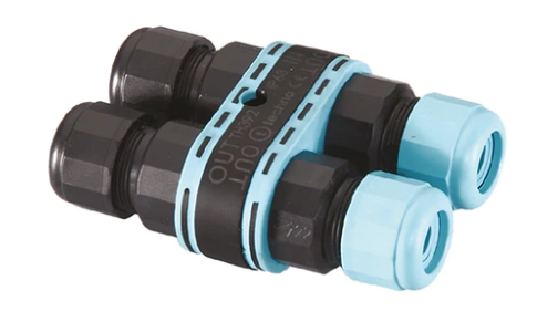
Box for Installation Petra/Idra 26