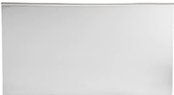
Satin Aluminium Carter Hyperion 160