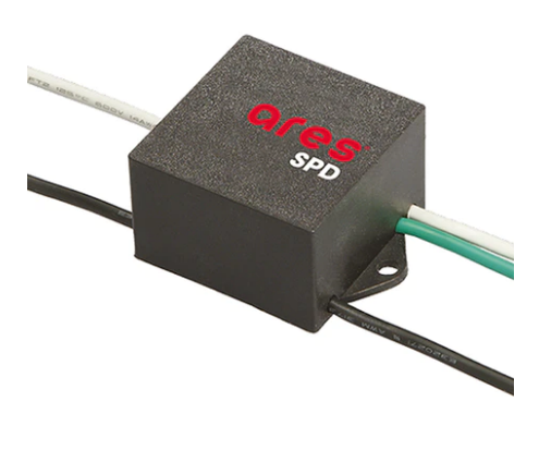
SPD (Surge Protection Device) 237