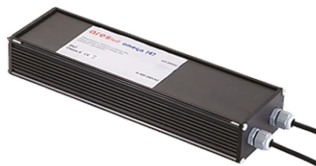
Power Supply 96W 120+277V/24Vdc Ip67 156