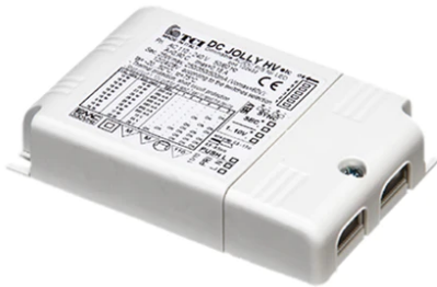
Power Supply 17W 110÷240V/24Vdc Ip20 144