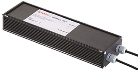
Power Supply 96W 120+277V/24Vdc Ip67 156