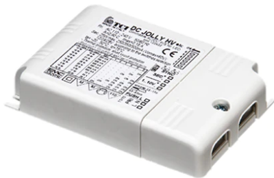
Power Supply 17W 110+240V/24Vdc Ip20 144