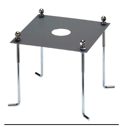
102 mm h 4000/5000 mm with Base 116