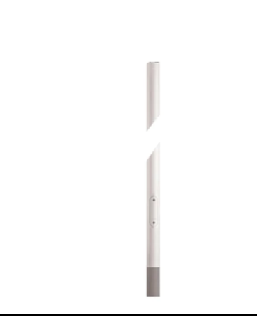
Pole Franco/Perseo/Dooku h 3500(+500 Pole Franco/Perseo/Dooku h 4500(+500 Base Plate and Fixing Bolts for Pole Ø mm Inground) mm Ø76 mm 250.6