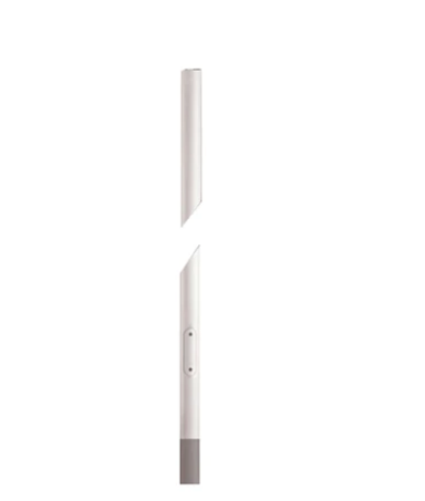
Pole Franco/Perseo/Dooku h 3500(+500 Pole Franco/Perseo/Dooku h 4500(+500 Base Plate and Fixing Bolts for Pole Ø mm Inground) mm Ø76 mm 251.3