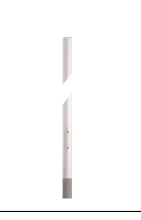
mm Inground) mm Ø76 mm 250.3