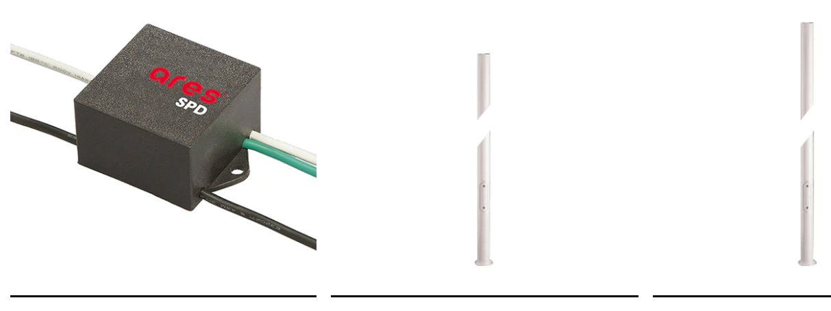
SPD (Surge Protection Device) 237