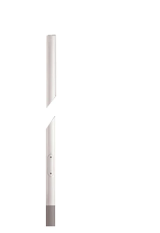
mm Inground) mm Ø76 mm 251.3