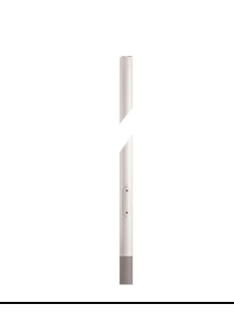
Pole Franco/Perseo/Dooku h 3500(+500 Pole Franco/Perseo/Dooku h 4500(+500 Base Plate and Fixing Bolts for Pole Ø mm Inground) mm Ø76 mm 250.3