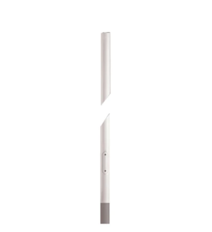
mm Inground) mm Ø76 mm 251.3