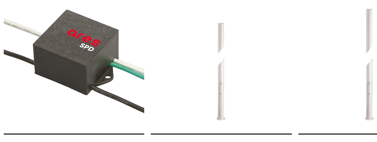
SPD (Surge Protection Device) 237