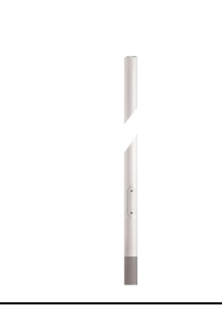
Pole Franco/Perseo/Dooku h 3500(+500 Pole Franco/Perseo/Dooku h 4500(+500 Base Plate and Fixing Bolts for Pole Ø mm Inground) mm Ø76 mm 250.6