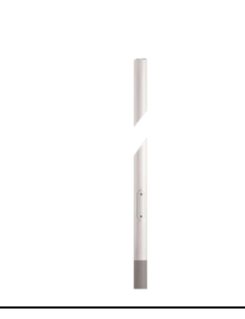
mm Inground) mm Ø76 mm 250.3