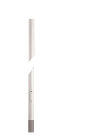
Pole Franco/Perseo/Dooku h 3500(+500 Pole Franco/Perseo/Dooku h 4500(+500 Base Plate and Fixing Bolts for Pole Ø mm Inground) mm Ø76 mm 251.3