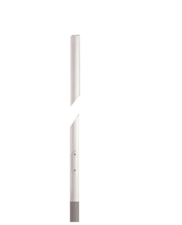
mm Inground) mm Ø76 mm 251.3