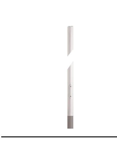
mm Inground) mm Ø76 mm 250.3