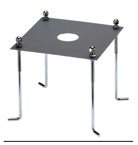
Pole Franco/Perseo/Dooku h 3500(+500 Pole Franco/Perseo/Dooku h 4500(+500 Base Plate and Fixing Bolts for Pole Ø 102 mm h 4000/5000 mm with Base 116