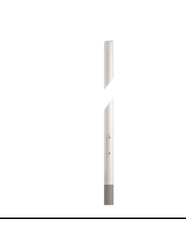
mm Inground) mm Ø76 mm 250.3