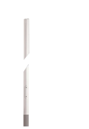
Pole Franco/Perseo/Dooku h 3500(+500 Pole Franco/Perseo/Dooku h 4500(+500 Base Plate and Fixing Bolts for Pole Ø mm Inground) mm Ø76 mm 251.3