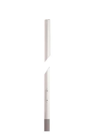
mm Inground) mm Ø76 mm 251.6