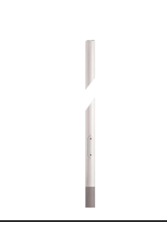
Pole Franco/Perseo/Dooku h 3500(+500 Pole Franco/Perseo/Dooku h 4500(+500 Base Plate and Fixing Bolts for Pole Ø mm Inground) mm Ø76 mm 250.6