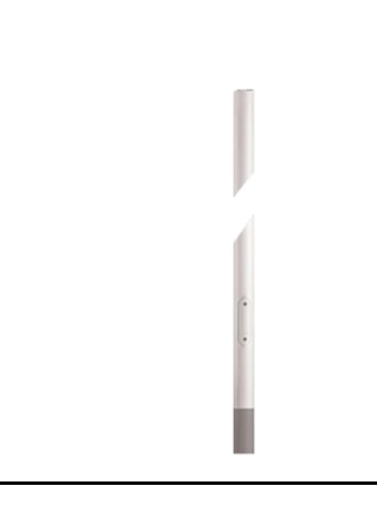
Pole Franco/Perseo/Dooku h 3500(+500 Pole Franco/Perseo/Dooku h 4500(+500 Base Plate and Fixing Bolts for Pole Ø mm Inground) mm Ø76 mm 250.6