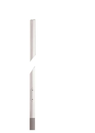
mm Inground) mm Ø76 mm 251.6