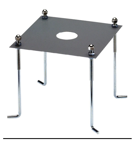
102 mm h 4000/5000 mm with Base 116