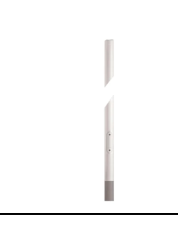
mm Inground) mm Ø76 mm 250.3