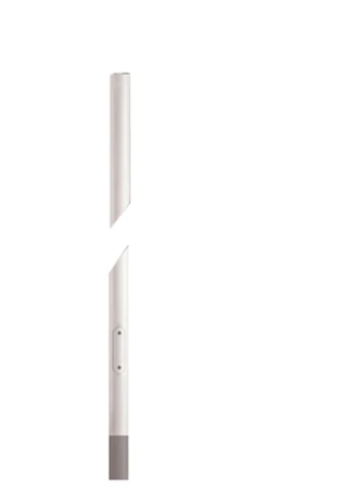
Pole Franco/Perseo/Dooku h 3500(+500 Pole Franco/Perseo/Dooku h 4500(+500 Base Plate and Fixing Bolts for Pole Ø mm Inground) mm Ø76 mm 251.3