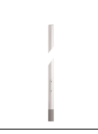
Pole Franco/Perseo/Dooku h 3500(+500 Pole Franco/Perseo/Dooku h 4500(+500 Base Plate and Fixing Bolts for Pole Ø mm Inground) mm Ø76 mm 250.3