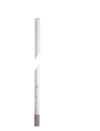
mm Inground) mm Ø76 mm 251.3