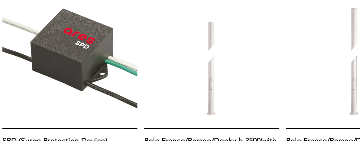
SPD (Surge Protection Device) 237