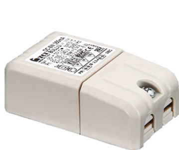
Power Supply 8W 100÷240Vac/24Vdc 350mA Ip20 150