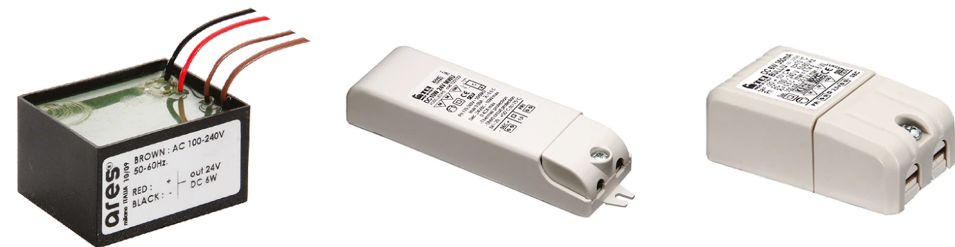
Power Supply 100÷240Vac/ 8W at 24Vdc/ 6W at 350mA Ip65 106