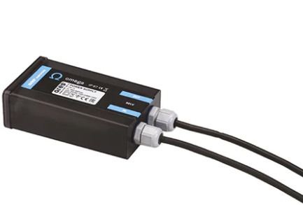
Power Supply 20W 220÷240V/24Vdc Ip67 147