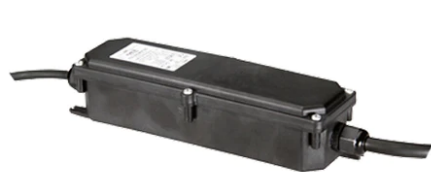
Power Supply 70W 220÷240V/24Vdc Ip67 110