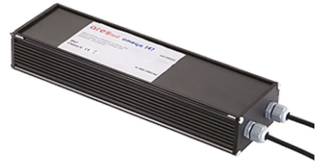
Power Supply 50W 120÷240V/24Vdc Ip67 155