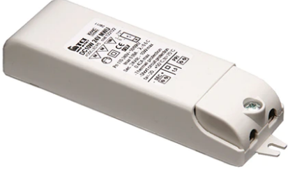
Power Supply 10W 110+240Vac/24Vdc Ip20 87