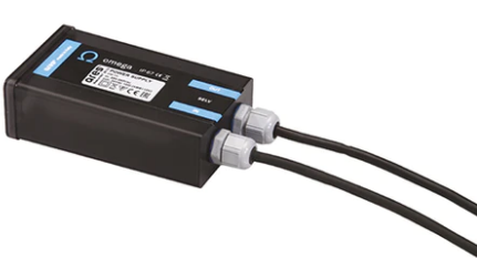
Power Supply 20W 220÷240V/24Vdc Ip67 147