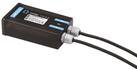
Power Supply 10W 110÷240Vac/24Vdc Ip20 87