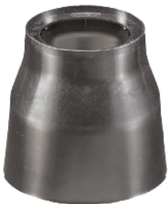
Box for Installation Clio 20