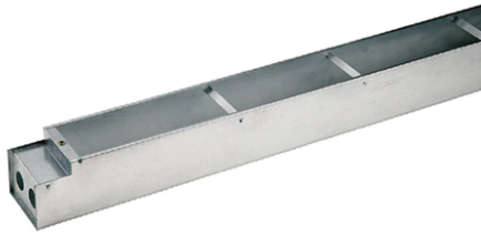
Box for Installation Cielo L 1245 mm 72