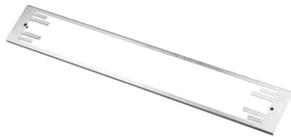
Frame For Ceiling Recessed Installation Cielo L 1245 82