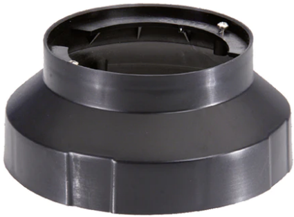
Box for Installation Chiara 50