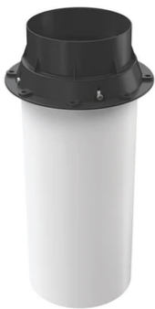
S.P.D. (SURGE PROTECTION DEVICE) F990E00A000