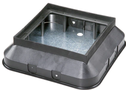
Box for Installation Cassiopea Square 74