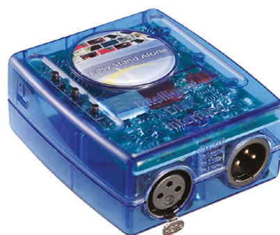
Dmx Controller Stand-Alone/PC Interface 143