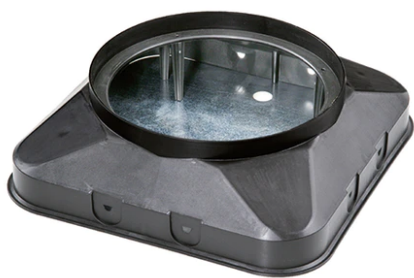
Box for Installation Cassiopea Round 73